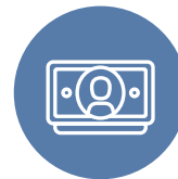
Payroll, Tax, Union Fringes, Certified Payroll Reporting