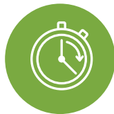
Time & Attendance Union Wage & Benefit Rates and Prevailing Wage Rates